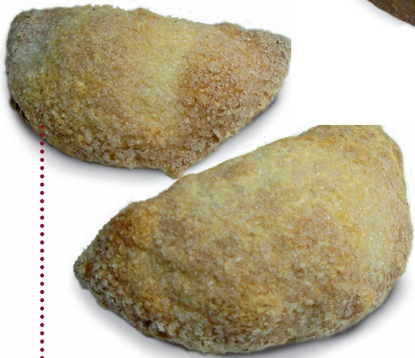
pastissets de moniato (o de carabassa)